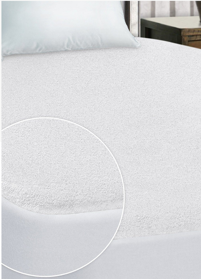
TERRY WATER PROOF MATTRESS PROTECTOR