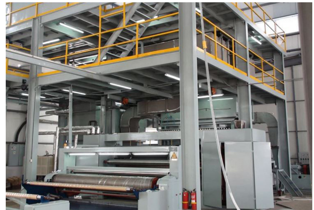
SPUNBOND PP NON WOVEN UNIT