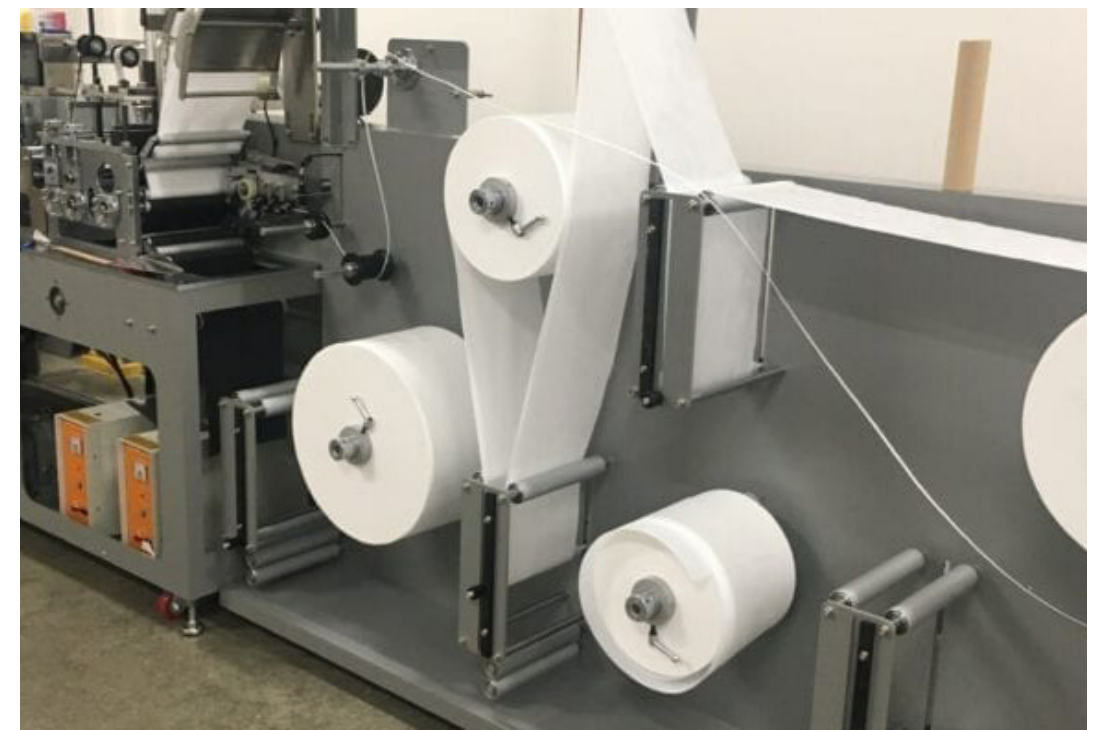
MASK MAKING UNIT