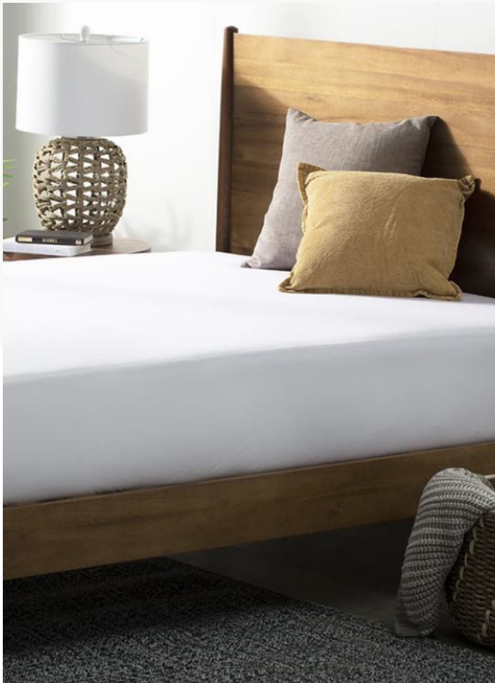
MICRO FIBER WATER PROOF MATTRESS PROTECTOR