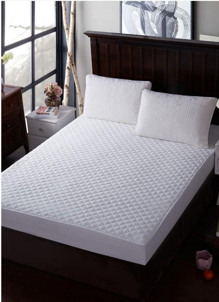
QUILTED WATER PROOF MATTRESS PROTECTOR