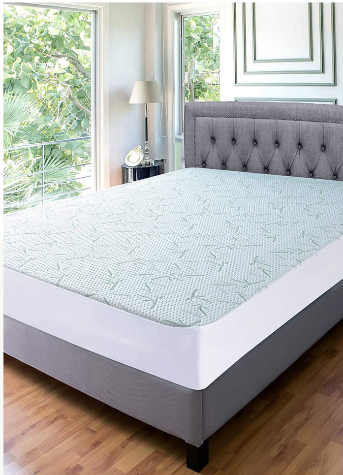
BAMBOO KNITTED WATER PROOF MATTRESS PROTECTOR