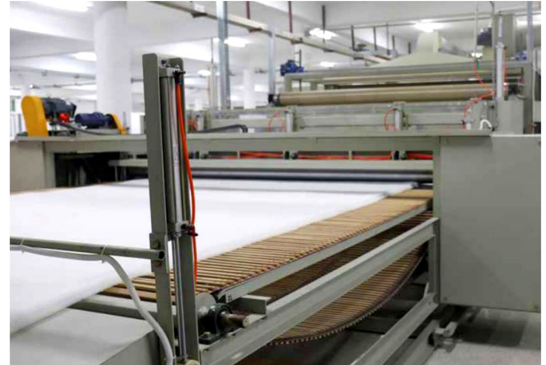
WADDING AND QUILTING UNIT