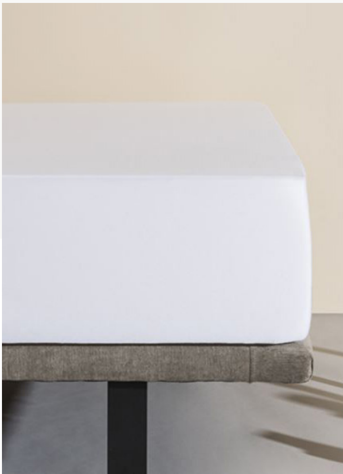
CTN JERSEY WATER PROOF MATTRESS PROTECTOR