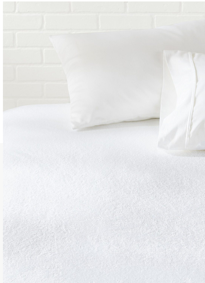
TENCEL JERSEY WATER PROOF MATTRESS PROTECTOR