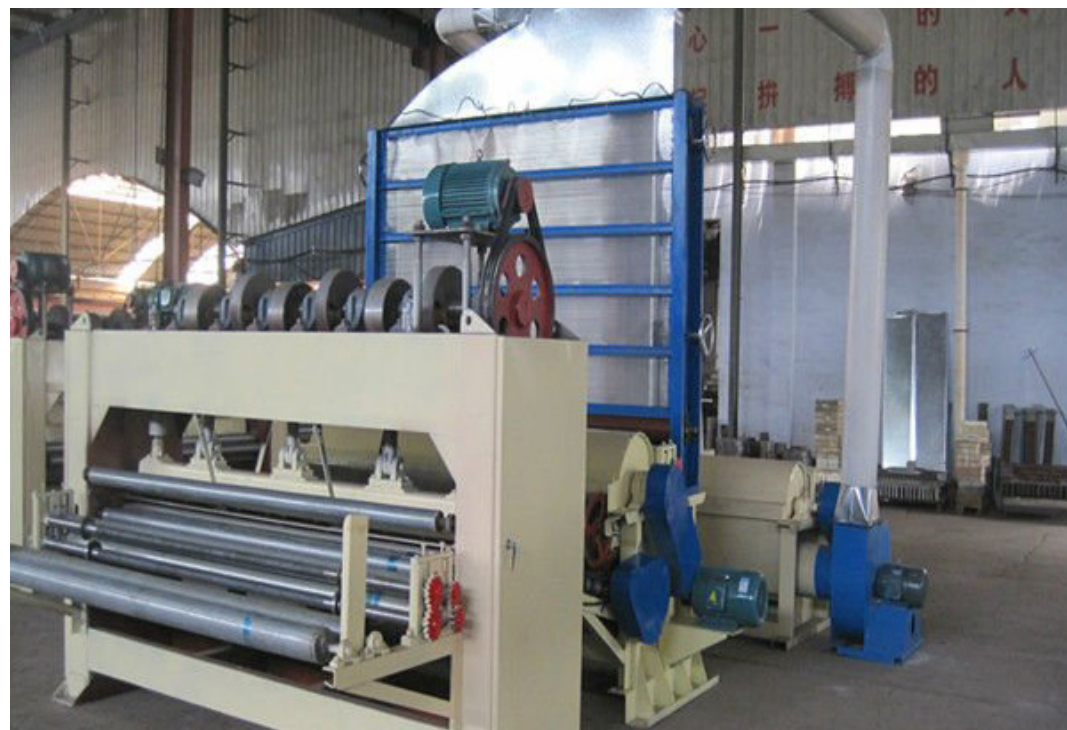
NEEDLE PUNCHING UNIT (NON-WOVEN)